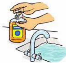
Wash your hands