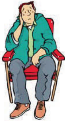
Tired and ache all over